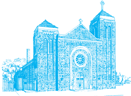
St. John Nepomuc